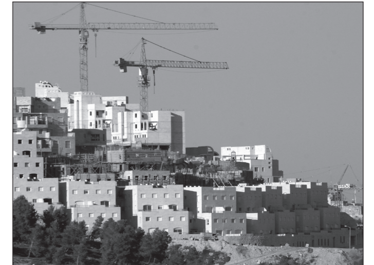
The illegal settlement of Har Homa, under construction

The Israeli government claims that the status of the West Bank, East Jerusalem, the Gaza Strip and the Syrian Golan Heights is 'disputed'. But this view flies in the face of international law (see box below). In fact, no state recognises Israel's right to continue to hold these Occupied Territories. Even Israel's own Supreme Court, in 2002, recognised that