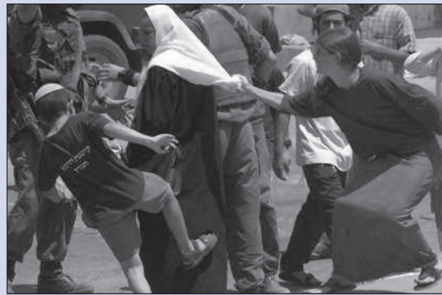
Hebron settler attacks a Palestinian woman.

fire with a submachine gun on Muslims at prayer. He killed 29 people, and wounded hundreds more. The attack triggered a response in which a further 26 Palestinians were killed, along with 9 Israelis.